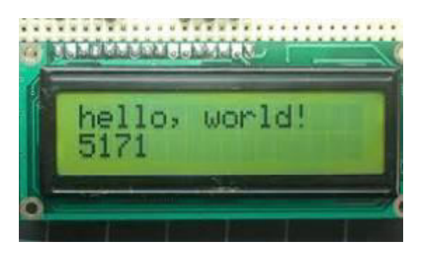
Figure 1.3 LCD Display 16*2

The term LCD stands for liquid crystal display. It is one kind of electronic display module used in an extensive range of applications like various circuits & devices like mobile phones, calculators, computers, TV sets, etc. These displays are mainly preferred for multi-segment light-emitting diodes and seven segments. The main benefits of using this module are inexpensive; simply programmable, animations, and there are no limitations for displaying custom characters, special and even animations,