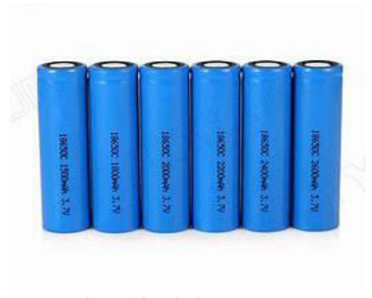
Figure 1.3 Lithium Battery

Uno is a microcontroller board based on 8-bit ATmega328P microcontroller. Along with ATmega328P, it consists other components such as crystal oscillator, serial communication, voltage regulator, etc. to support the microcontroller. The Arduino Uno comes with USB interface, 6 analogue input pins, 14 I/O digital ports that are used to connect with external electronic circuits. Out of 14 I/O ports, 6 pins can be used for PWM output. It allows the designers to control and sense the external electronic devices in the real world